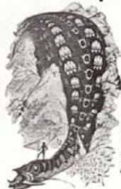
Kholumolumo, the world-eating monster (Sotho, South African)

Monsters and magicians, marvels and mysteries – this encyclopaedic reference work is an essential sourcebook for all fantasy and sf fans, opening the doors to the outlandish and disturbing worlds of our ancestral imaginations – worlds that still have a strange and powerful fascination for all of us today.