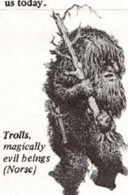
Trolls, magically evil beings (Norse)

Monsters and magicians, marvels and mysteries – this encyclopaedic reference work is an essential sourcebook for all fantasy and sf fans, opening the doors to the outlandish and disturbing worlds of our ancestral imaginations – worlds that still have a strange and powerful fascination for all of us today.